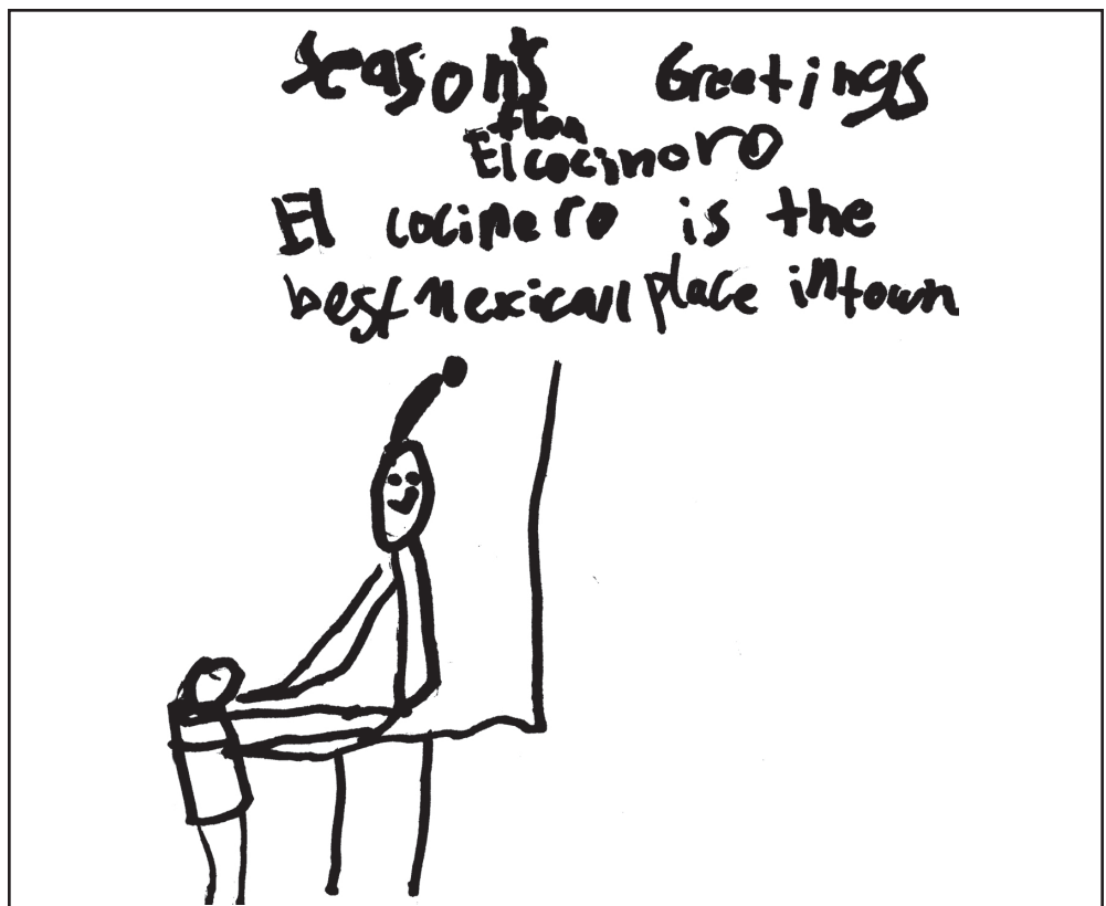
AJ Frease • 3rd Grade Prairie City Elementary