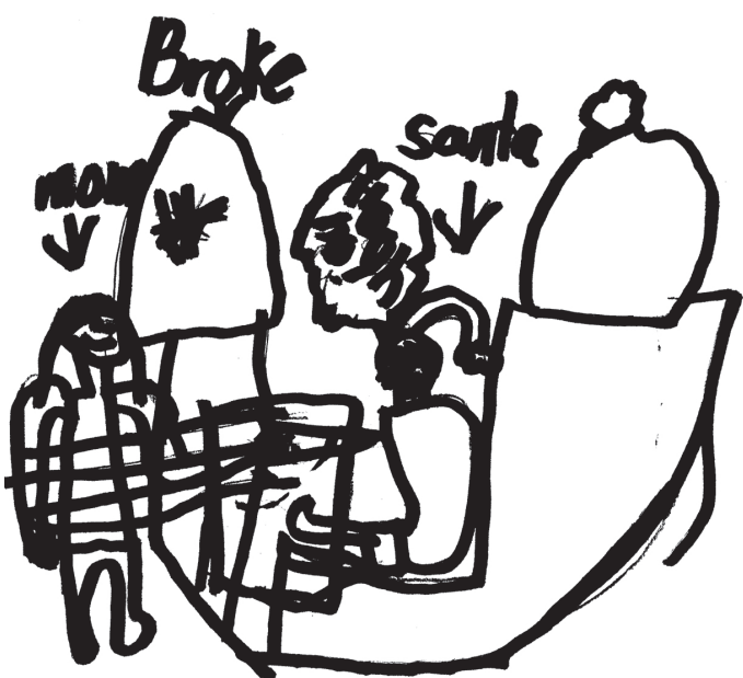
Makenna Ford • 5th Grade Humbolt Elementary

Mobile Glass 27825 Wilderness Road John Day 541-575-1055 | CCB# 175517