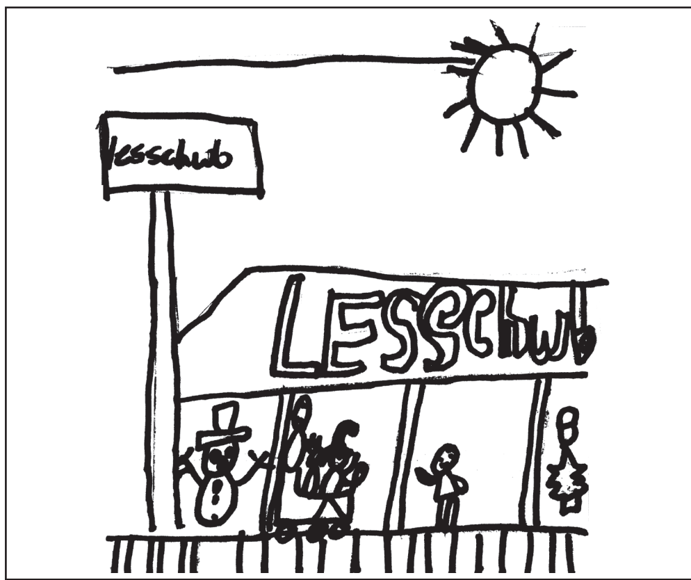
Sonja Harig • 5th Grade Prairie City Elementary