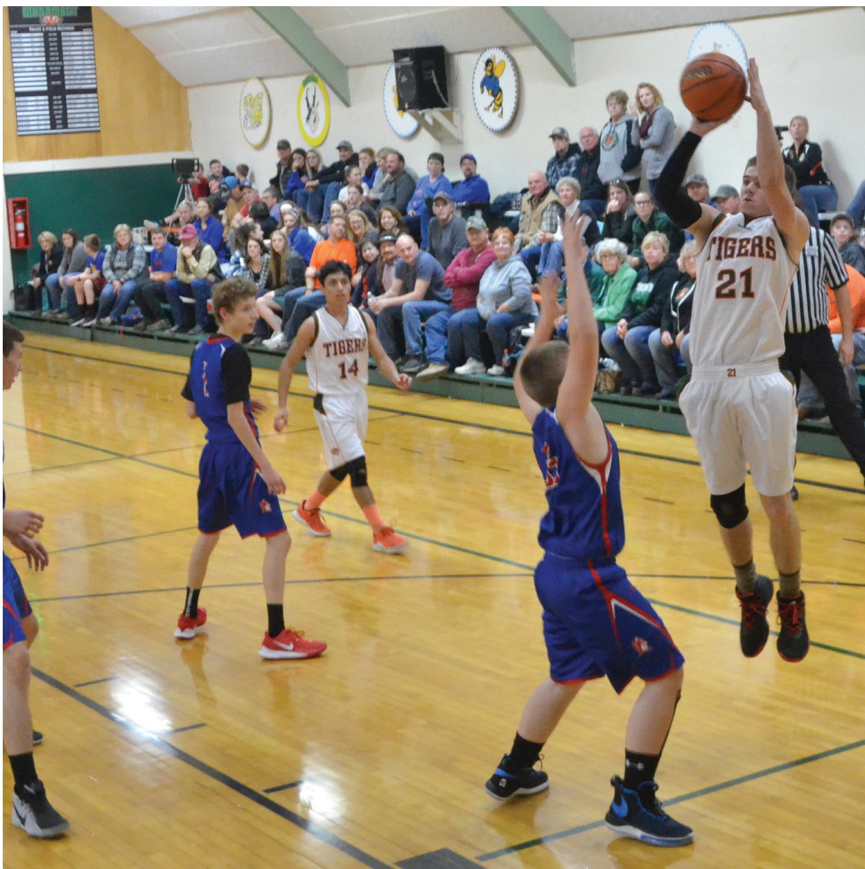
The Eagle/Alix Hand