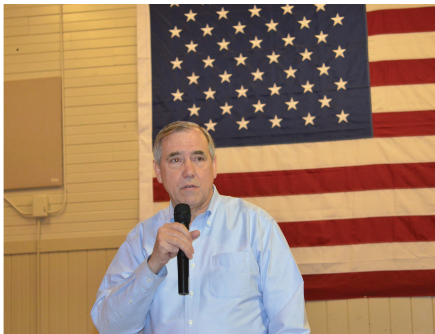
U.S. Sen. Jeff Merkley at a Grant County town hall.