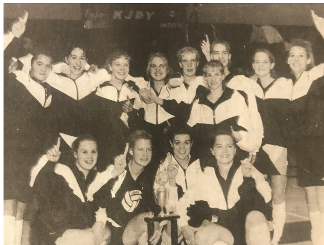
Nov. 10, 1994