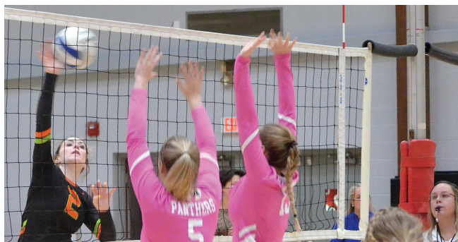
The Eagle/Angel Carpenter Dayville/Monument Tiger Brooklyn Near (2) slams the ball over the net to the awaiting Prairie City Panthers.

just hoped everything would come together.”