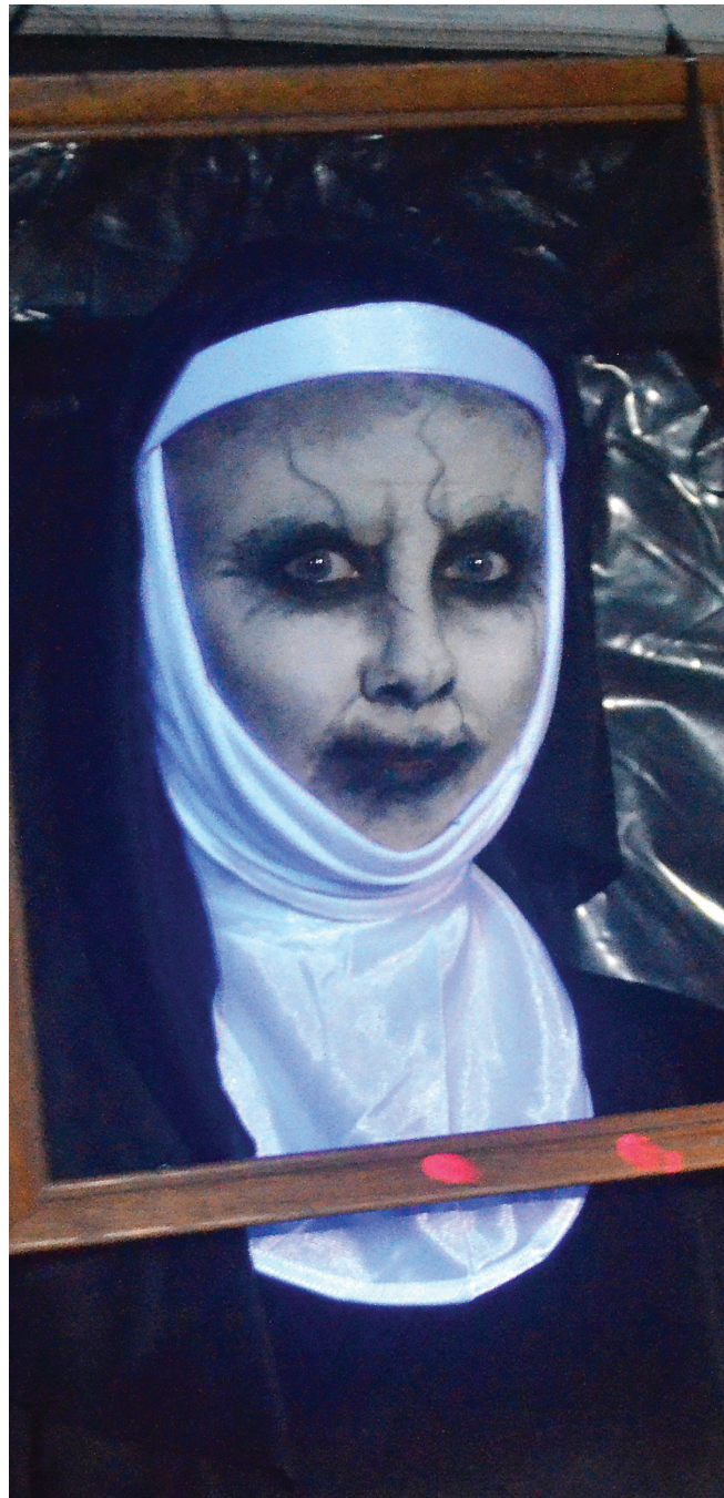
An actor in the Canyon City Haunted House gives a piercing stare on Halloween last year.

• 6 p.m., Prairie City School cafeteria The community event sponsored by American Legion Auxiliary Prairie City Unit 106 honors veterans. The main dish will be glazed ham. Bring a potluck dish to share. For more information, call 541-820-4463 or 907-723-7613.