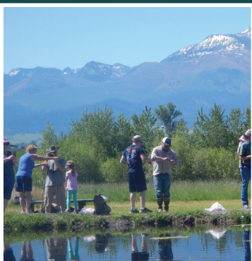
EDUCATION & OUTREACH