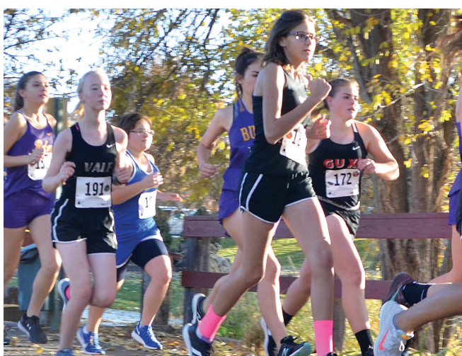
The Eagle/Angel Carpenter