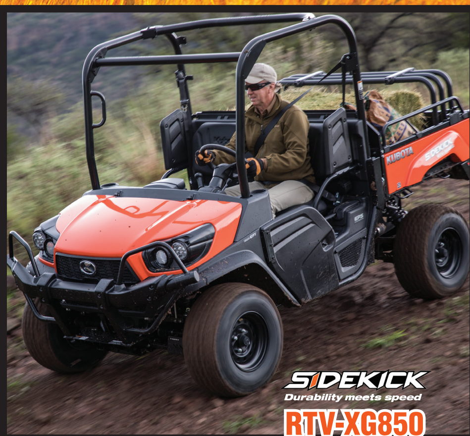
SIDEKICK Durability meets speed RTV-XG850