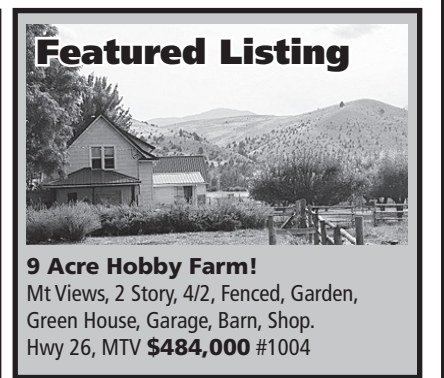
9 Acre Hobby Farm! Mt Views, 2 Story, 4/2, Fenced, Garden, Green House, Garage, Barn, Shop. Hwy 26, MTV $484,000 #1004

UNITY / DREWSEY 5 Ac Unity Lake! Well/Power/Phone. Figi Lane, Unity $60,000 #995 160 Ac w/Beautiful Log Home! 3600 Sq Ft, 3/2, Deck, Patio, Drewsey. $570,000 #1002 HUNTING/RECREATIONAL 5 Timbered Ac w/Off Grid Cabin! 784 SF, JD $69,500 #1001 310 Ac, Remote, Limited Access, LOP Tags. Wiley Crk Rd, DV $175,000 #763 COMMERCIAL Large Commercial Building! 2100 Sq Ft, 2 Spaces, Oil Heat, 437 W Main, JD $125,000 #991 Beautiful Office! Large Lot, 1392 SF, Kitchen, 2 Bath, Basement. 235 S Canyon Blvd, JD $137,900 #931 Great Place For A Business! Large Shop w/Mt Views On 1 Acre, Located near Industrial Park, 4104 Sq Ft. $245,000 #994 Established Business In Canyon City! Hardware, Tools, Building Supplies, Large Fenced Retail Area, Inventory Included. 124 N Clark St, CC $450,000 #998 HOMES ON ACREAGE 42 Ac, Mt & Valley Views! MF, 3/2, Carport, Shop, Barn, Fenced. Picnic Crk Rd, MTV $380,000 #987 8 Ac, Unique Earth Berned Home! Fabulous Views, Pride Of Ownership, 3/2, Patio, Carport, Garage w/Shop Area, Large Shop. John Day. $435,000 #894 Stunning Home On 27 Acres! Spectacular Views, 2484 Sq Ft, 3/2, 3 Car Garage, 3 Bay Shop. Antelope Ln, JD $500,000 #993 78 Private Timbered Ac w/Views! 1665 SF, 2/2, Deck, Shop, Barn, RV Set Up. Laycock Crk Rd, Mt Vernon $545,000 #999 560 Ac, Off Grid Seclusion! 2 Story, Barn, Riding Area, Shop, Creek, LOP Tags, 86 Acres of Water of Record Rights. Luce Creek Rd, JD $995,000 #845