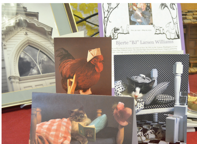
The Eagle/Angel Carpenter

Some of Williams' greeting cards are currently available for sale at the Grant