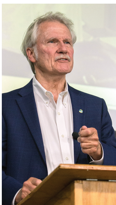
Former Oregon Gov. John Kitzhaber shares his thoughts about health care delivery in Oregon on Thursday at the EOCCO Clinician & Staff Summit in Hermiston.

One way out, he said, is funding health care from a specific pot of money indexed to a sus-