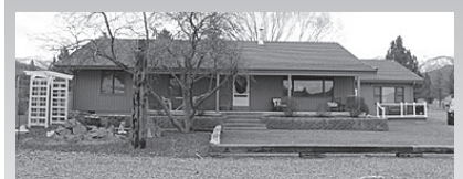
5.52 Ac, Small Acreage Dream! Lovely Home w/Nice Views, Open Concept Living, Vaulted, Natural Light, 3/2, Deck, Landscaped, Shop. John Day. $500,000 RMLS #19229983

JOHN DAY/CANYON CITY Upgrades Throughout, 2/1, Fenced Yard, Storage Shed, 200 W Izee, CC $76,000 #931