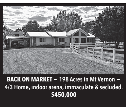
BACK ON MARKET ~ 198 Acres in Mt Vernon ~ 4/3 Home, indoor arena, immaculate & secluded. $450,000

541-934-2946 Office 541-519-6891 Cell 41909 Copper Creek Rd. Kimberly OR 97848 Follow us on facebook!