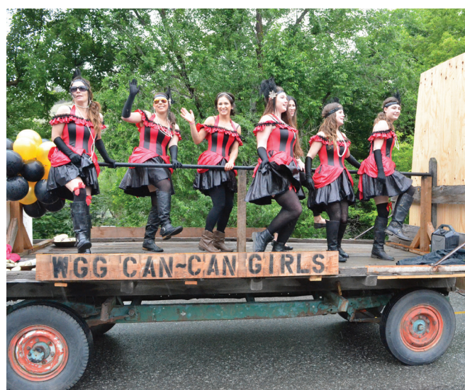
The Whiskey Gulch Gang Can-Can Girls brave a light drizzle during the '62 Days parade in Canyon City in 2018.

cial deals and refreshments will be available at participating business. For more information, visit the Downtown John Day First Friday Facebook page.