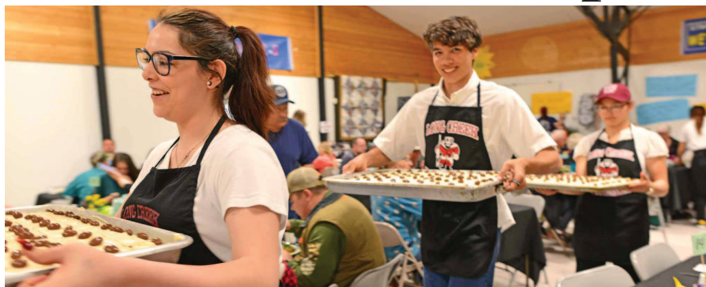
Funds were raised for Long Creek first responders during a dinner and auction April 27.

A raffle of gift baskets, handmade items, gift certificates, toys and other prizes, along with an auction of artwork and other treasures filled the evening with generosity and community pride.