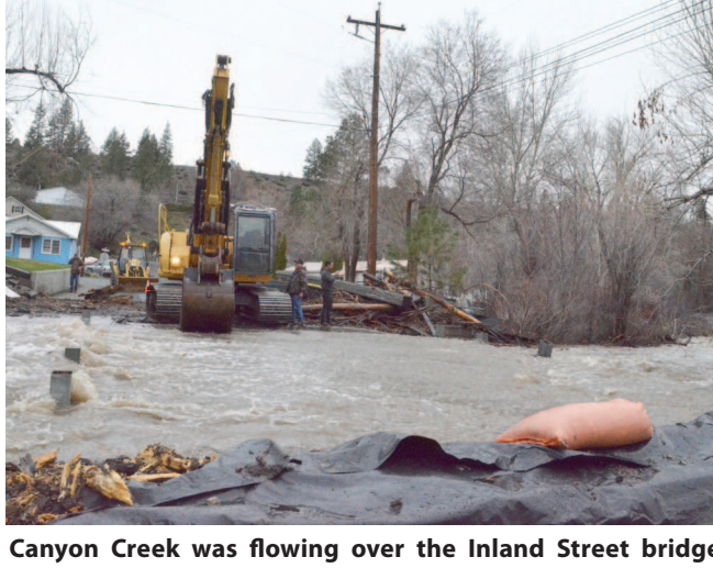
Canyon Creek was flowing over the Inland Street bridge in Canyon City by Tuesday morning, April 9, and extensive sandbagging was in place to protect nearby properties. The pedestrian bridge and the railings had been removed to improve flow. A county excavator was in place to remove logs and other debris.

School buses had been moved from the bus barn to a parking lot just north of the high school. In 2011, flooding at Inland Street ran into the Gibco store, with about 1.5-foot high flood water run-