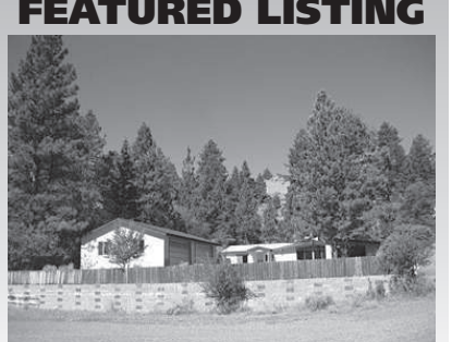
Large Family Home, 4/2, Garage. 205 Nugget St CC $225,000 #952