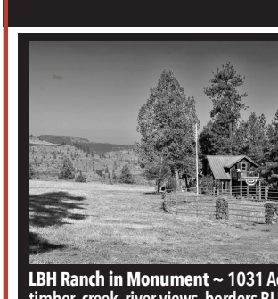
LBH Ranch in Monument ~ 1031 Acres ~ 3/3 cabin, timber, creek, river views, borders BLM. $1,195,000

541-934-2946 Office 541-519-6891 Cell 41909 Cupper Creek Rd. Kimberly OR 97848