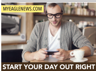
START YOUR DAY OUT RIGHT

Sportfisher LLC Company is offering 30 temporary outdoor agricultural positions in Yakima County in the state of Washington. Qualified workers must have 3 months of tree fruit experience and must be legally authorized to work in the U.S. Workers will hand harvest apples and perform related tree-fruit based agricultural work at a guaranteed wage of $15.03/hr. Piece rates for apples is between $20-24/bin. Specific piece rate wage information can be obtained from your local State Work Force Agency. Anticipate a 40 hr. work week and 75% of hours guaranteed. Free housing available for workers who cannot reasonably return to their residence each day. Tools, supplies and equipment will be provided at no cost to the worker. Transportation and subsistence expenses to the worksite will be provided by the employer upon completion of 50% of the contract. Positions are available from 05/01/2019 through 10/31/2019. The local SWA office is WorkSource Sunnyside. Workers may also call 509-346-1410 for an over the phone interview or for an in person interview at 12096 Road A SE, Othello, WA 99344. Please reference job order number 205158281.