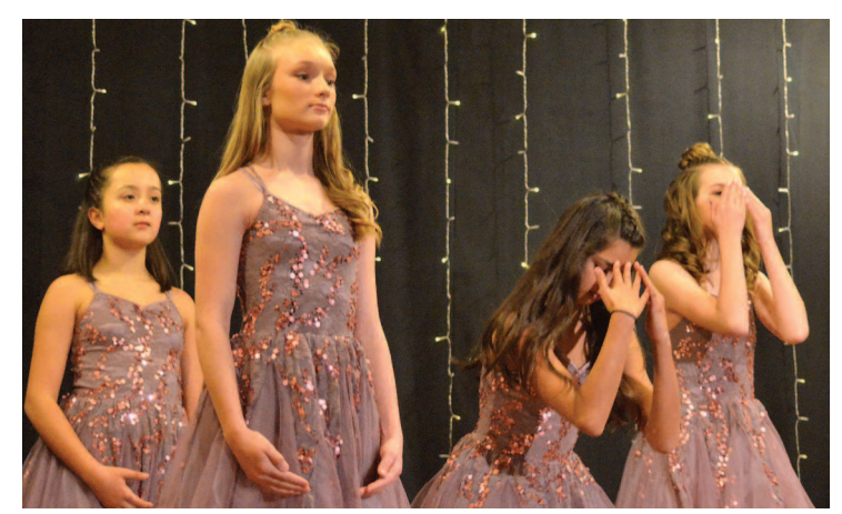
The Dancers Divine group performs at Saturday's Winter Wonderland dance recital at Canyon City Community Hall.