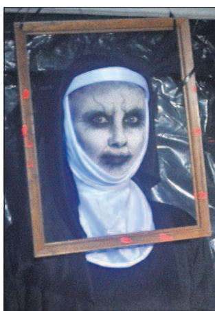
The Eagle/Angel Carpenter An actor in the Canyon City Haunted House gives a piercing stare on Halloween.