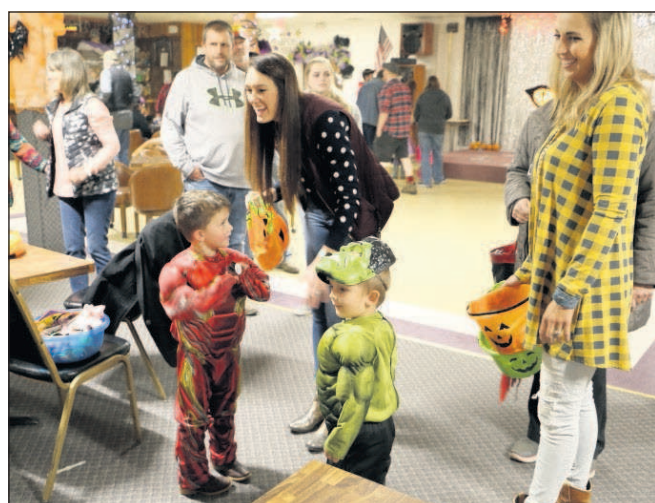
Children enjoy activities at the youth Halloween party at the John Day Elks Lodge Oct. 30.