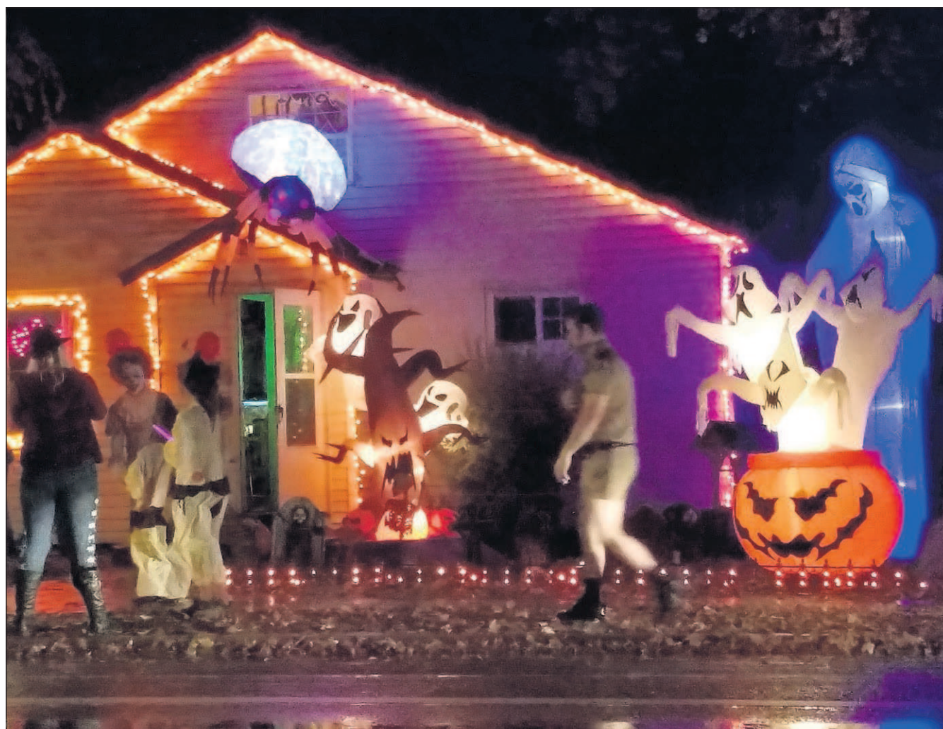
A spooky John Day home welcomes trick-or-treaters.