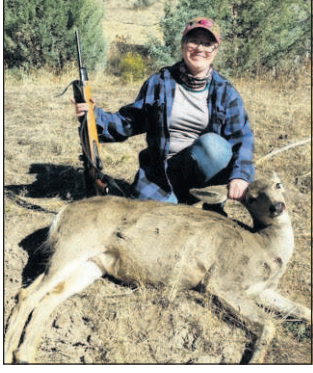
Emma Valade shot this doe in 2018.