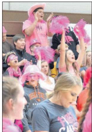
Grant Union students cheer on their team.

The Grant Union Prospector volleyball team ended their regular season undefeated in the Blue Mountain Conference after sweeping the Enterprise Outlaws and Pilot Rock Rockets at the 10th Annual Dig Pink Rally Saturday.