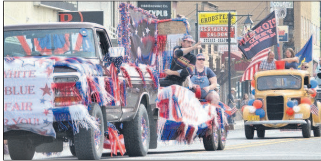
Commercial floats, including Chester's Thriftway and Pioneer Feed, added to last year's colorful Grant County Fair Parade. The parade is at 10 a.m. Saturday this year.