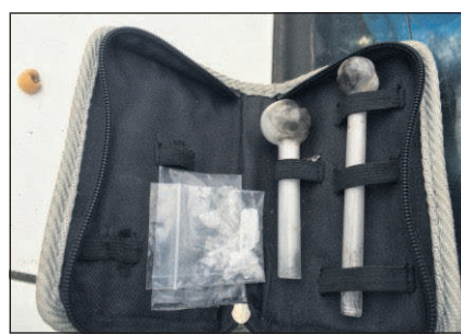
Baggies containing methamphetamine and two glass pipes used for smoking in a drug kit confiscated by local police during a traffic stop in 2016.