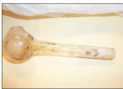
A glass pipe with methamphetamine residue that was seized by local police.