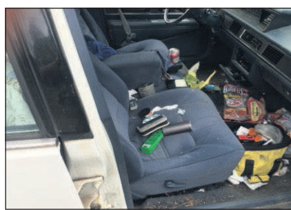
Local police found methamphetamine and glass pipes in a kit sitting on the passenger seat of this vehicle during a traffic stop in 2016.