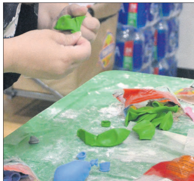
The Eagle/Angel Carpenter