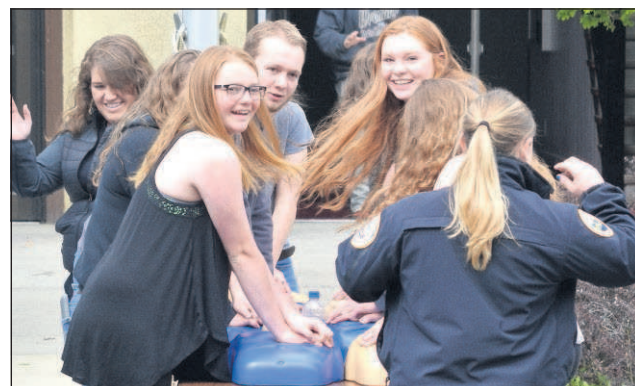
The Eagle/Angel Carpenter

Humbird also arranged for a mental health promotion panel, which included a substance abuse counselor, addiction specialist and two mental health counselors from Community Counseling Solutions,