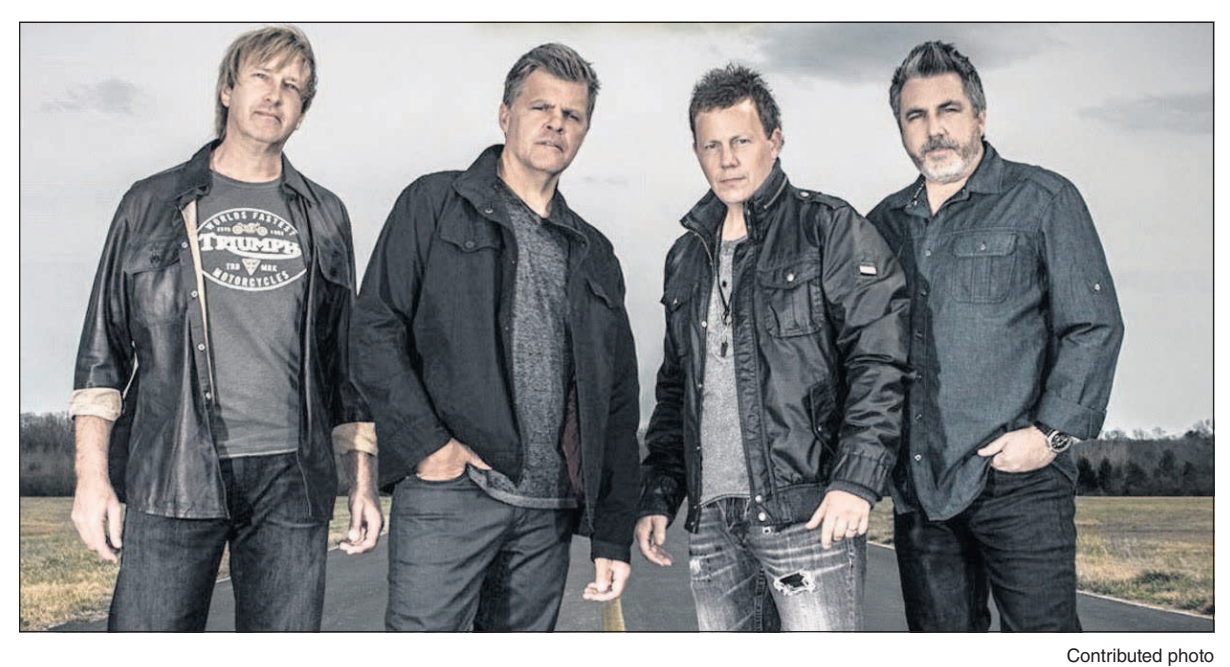
Lonestar will perform at the Grant County Fair on Aug. 17.

There are plenty more hits from the band's 10 albums, including nine other No. 1 singles, which should