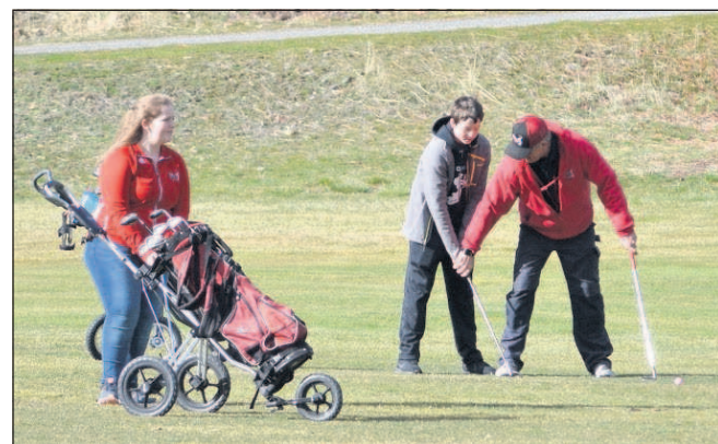
The Eagle/Angel Carpenter

For more information, call Lallatin at 541-575-0715.