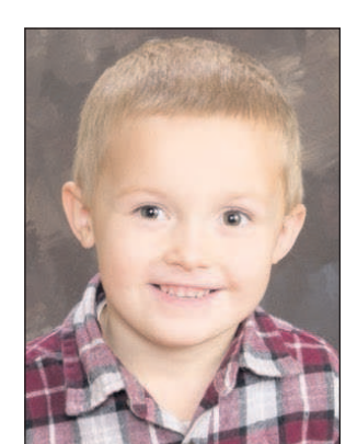
Daniel Watkins Kindergarten