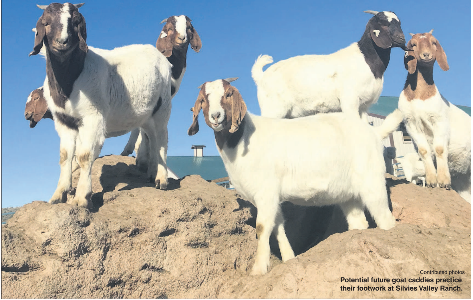
Contributed photos Potential future goat caddies practice their footwork at Silvies Valley Ranch.