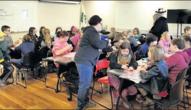
A group of youths enjoy a STEM (science, technology, engineering and math) activity with leaders during the Jan. 26 open house at the Oregon State University Extension office in John Day. The daylong event featured a full slate of activities, including tree care and interior decorating workshops.