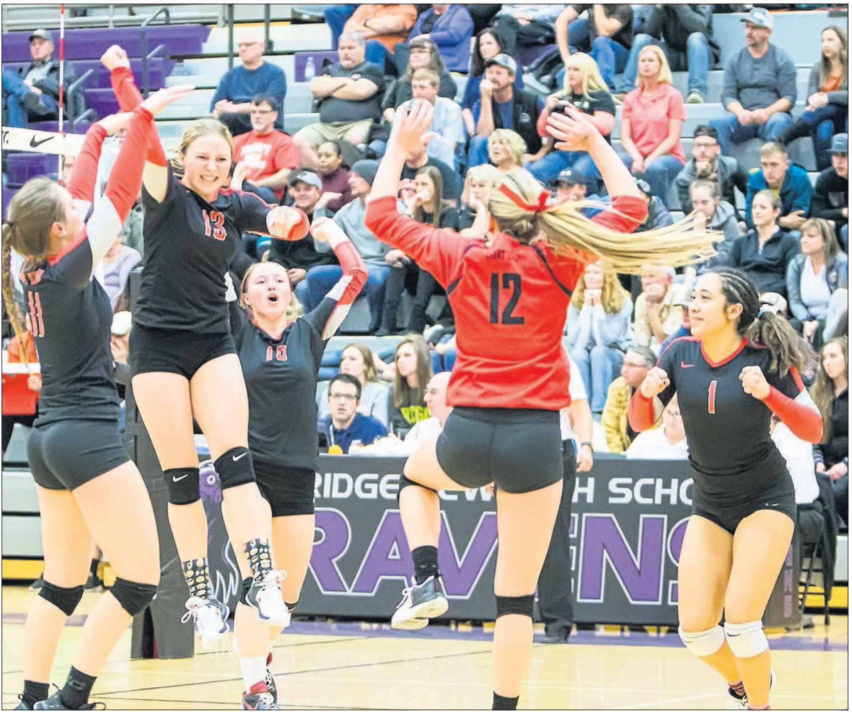
15. The Grant Union Prospector team celebrates their win at the OSAA Volleyball State Championships.