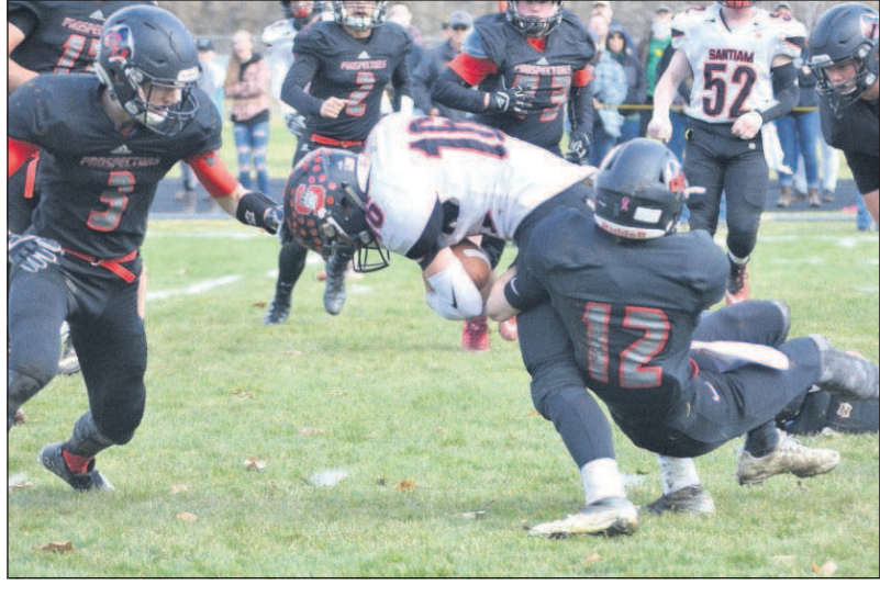
Eagle photos/Angel Carpenter