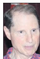
U.S. Sen. Ron Wyden

Every year, I hold town halls in each of our state’s 36 counties to hear directly from Oregonians on the key issues facing rural and urban communities. During these meetings, and traveling between them, I have heard and seen firsthand the importance of getting affordable broadband internet access, high-speed wireless broadband and strong, consistent cell service throughout Oregon.