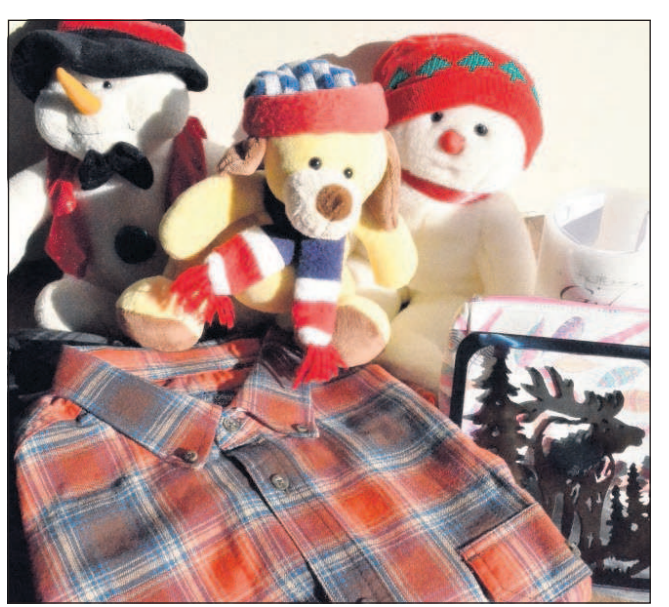
Donated items to the Veterans Gift Shop are being accepted at Mosier's Home Furnishings where they'll be on display until they are delivered to the Portland VA Medical Center on Nov. 10.