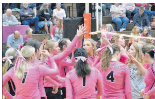
The Grant Union Prospectors huddle during the Dig Pink games.