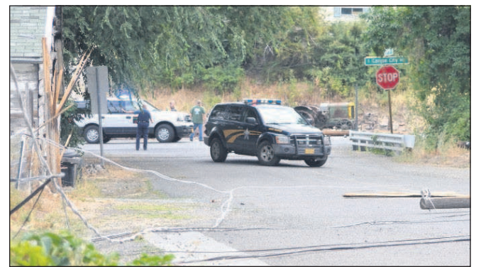
The Eagle/Angel Carpenter

crews to remain a safe distance away until given the all-clear to move in. Voltage can be radiating from the downed line into the ground. If responders step too close, electrical voltage can come back up through the ground and electrify the emergency