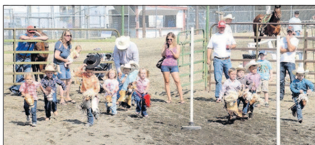
Children compete in the stick horse race in a previous youth rodeo after the Grant County Fair. The Grant County Fair Kids/Junior Rodeo is scheduled for Saturday, Aug. 26, this year.