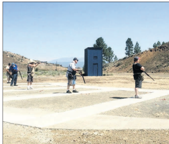
File photo Shooters take aim at a previous memorial trap shoot at the Seneca Range. The annual past members memorial trap shoot is scheduled for Sunday, Aug. 27, this year.