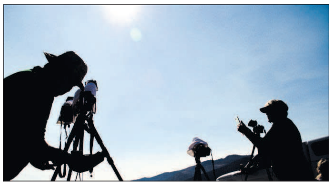
The Eagle/Rylan Boggs