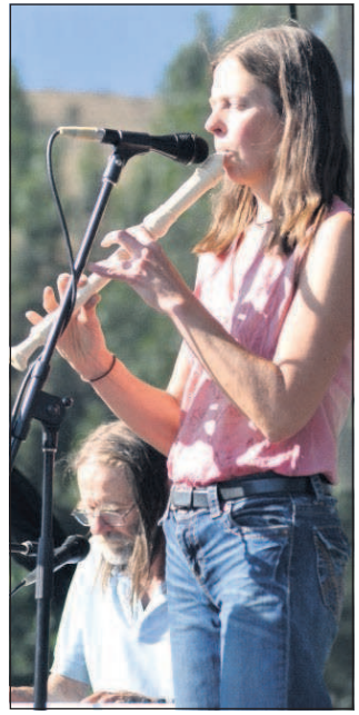
Lyttlewood, a Long Creek duo, performs at Saturday's MoonLIT Music Festival.