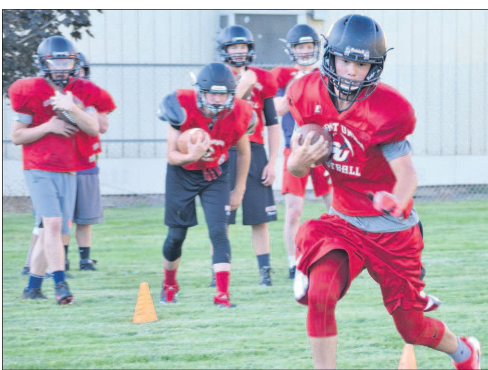
The Eagle/Angel Carpenter

"We have 12 seniors, and 10 are returning starters on