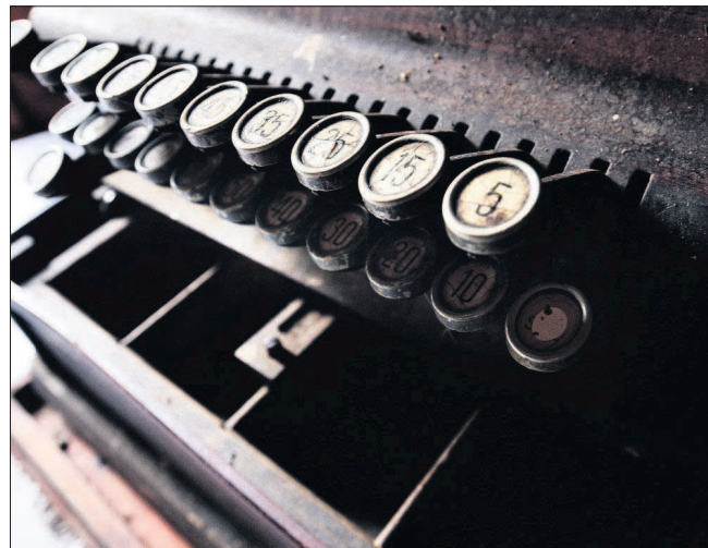
An old cash register sits on a table in the dance hall of the hotel at Ritter Hot Springs.