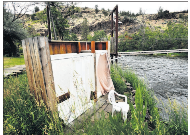
Spring fed showers overlooking the Middle Fork John Day River offer a relaxing hot shower to guests before taking in one of the soaking pools.