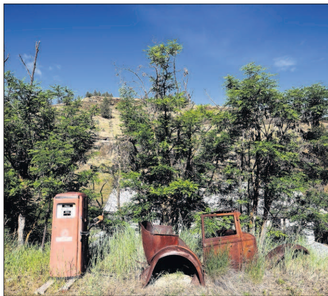
An old fuel pump and car frame sit in a field above the hotel at Ritter Hot Springs.