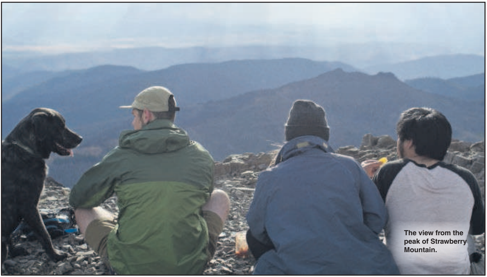
The view from the peak of Strawberry Mountain.

A multi-day loop will take you to all of these attractions as well as through thick forests, exposed ridges and recovering burn areas. With ample opportunities for great landscape and wildlife photography, the Strawberry Wilderness is a great place to lose the crowds and find yourself.