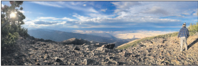
The view from Strawberry Mountain.