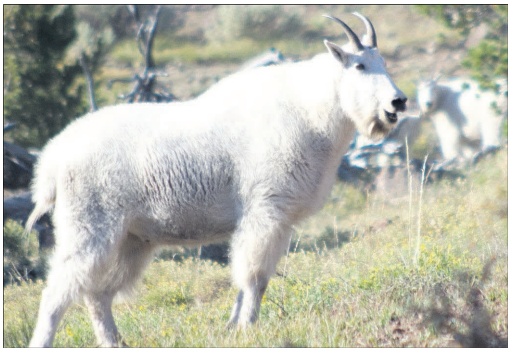
A mountain goat moves up a ridge in the Strawberry Mountain Wilderness.