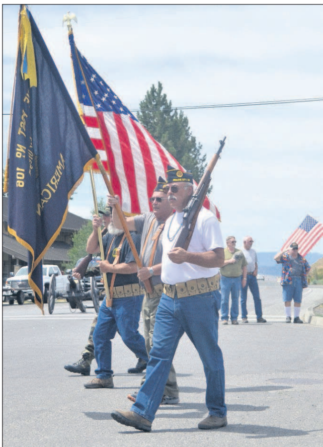
The Eagle/Angel Carpenter

The Dayville parade featured fire trucks, horses and more candy than the kids could handle.