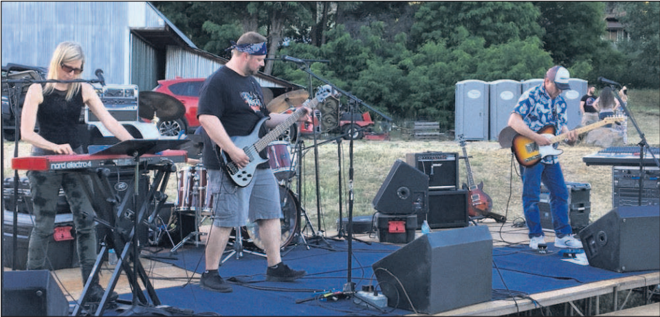
I4NI plays during the Grub & Grog at the Seventh Street Complex Friday, June 23.