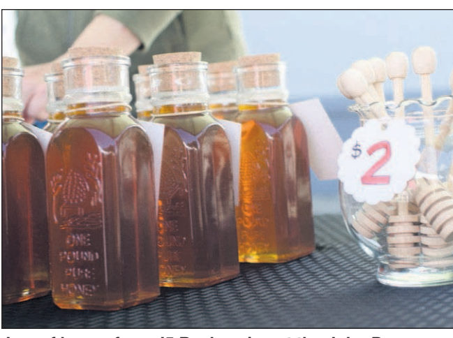
Jars of honey from J5 Beekeeping at the John Day Farmers Market Saturday, June 17.

She uses American-made materials whenever possible and said she is more con-