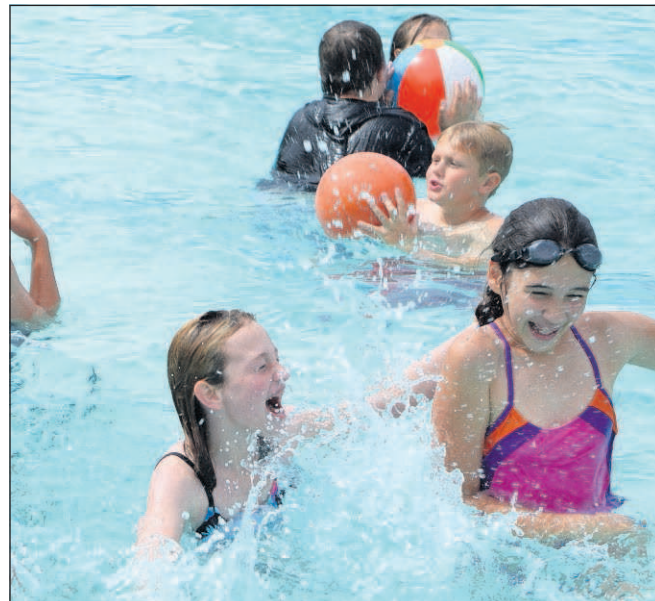
Splashing children enjoy opening day at Gleason Pool in John Day last year. The pool is set to open June 12 this year.

Parks and Recreation department website, jdcpcparksandrec.weebly.com or at the pool. For more information, call 541-620-4001.