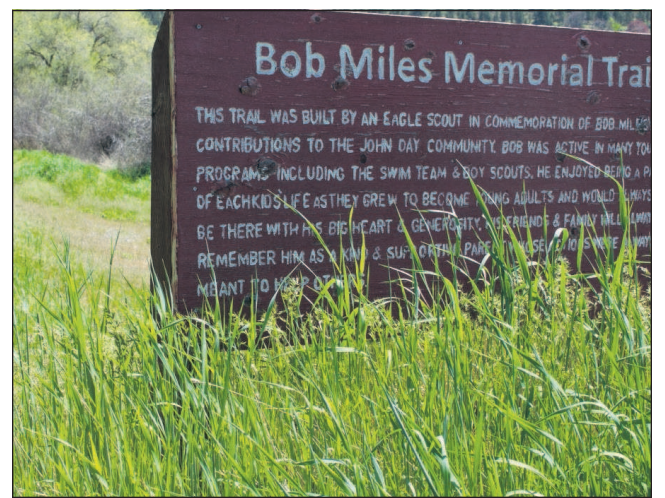
The Eagle/Rylan Boggs

The city is working to annex the property into the city limits. It is currently in the urban growth boundary. As a condition of the sale, six acres on the