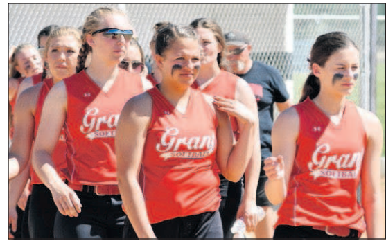
The Grant Union Prospector softball team after the May 19 district playoff game against Burns.