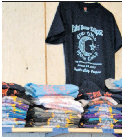
Solar Eclipse T-shirts of all sizes line the walls of Grumpy's Graphics, including one hanging up that reads: "Total Solar Eclipse, Stay Wild Moon Child."

and more shirts," she said. "We're hoping we can accommodate everyone's wants and needs."