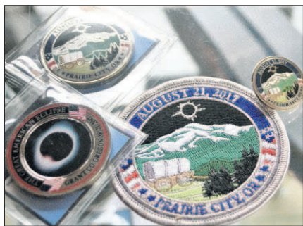
Patches, pins and coins with a solar eclipse theme are available at Grumpy's Graphics in Prairie City.